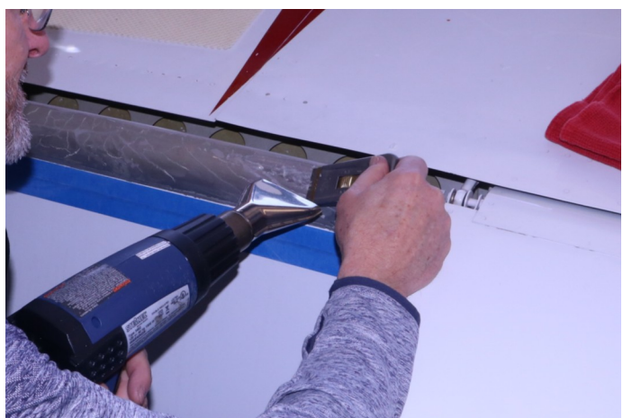
Behold! The finished product! It looks beautiful Nice work Billy! Chapter 974 thanks you for sharing your project and salutes your effort Congratulations!

Above, note the frosty cracked appearance of the tape. It was probably the protective film that comes attached to the aluminum sheets in the original kit. Left and below, Billy is using a heat gun and razor scrapper to remove the tape.